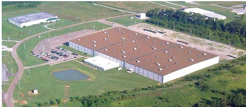
MacLean factory in Trenton, TN

The Strandvise product is the “original” automatic connector, and the only product “Made in the USA”. Every product is stamped with a date code for traceability. Accept no substitute !